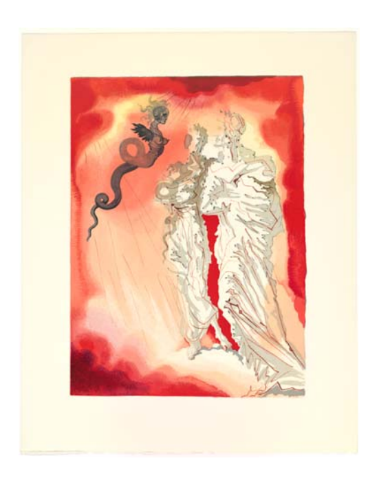
Illustration for The Divine Comedy © Salvador Dalí, Fundació Gala-Salvador Dalí/VEGAP, 2017

This series was commissioned by the Italian Istituto Poligrafico to commemorate the seven hundred years of Dante's birth. Dali used a mix of techniques, mainly watercolour, gouache and red ink on paper in folio format. Finally, one hundred illustrations were reproduced between 1959 and 1963 through a process of relief photogravure with woodblock screen.