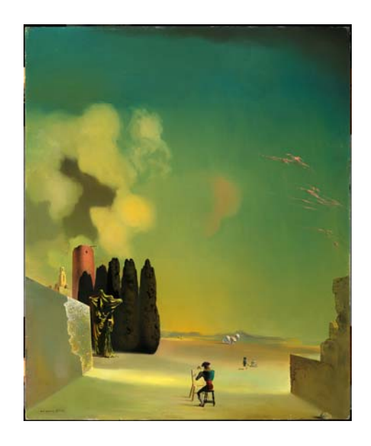
Enigmatic Elements in a Landscape, 1934 © Salvador Dalí, Fundació Gala-Salvador Dalí/VEGAP, Figueres, 2017

The exhibition begins with a selection of surrealist oil paintings (1934-1937) that include elements arranged in an enigmatic landscape of the Empordà region. Through his paranoiac-critical method, Dalí represents his obsessions in the landscape, a landscape that evokes childhood memories, ghostly spectrums, characters hidden or revealed. The landscape is a leitmotif in the work of Dali, an ultra-local element to which Dalí gives a universal value. A good example of which is the painting Enigmatic Elements in a Landscape , included in the show.