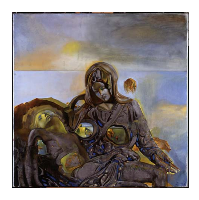
Geological Echo, after Michelangelo's "Pietà" 1982