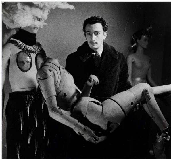
Salvador Dalí and his mannequin at the Exposition Internationale du Surréalisme, Paris, 1938. Image rights of Salvador Dalí reserved.