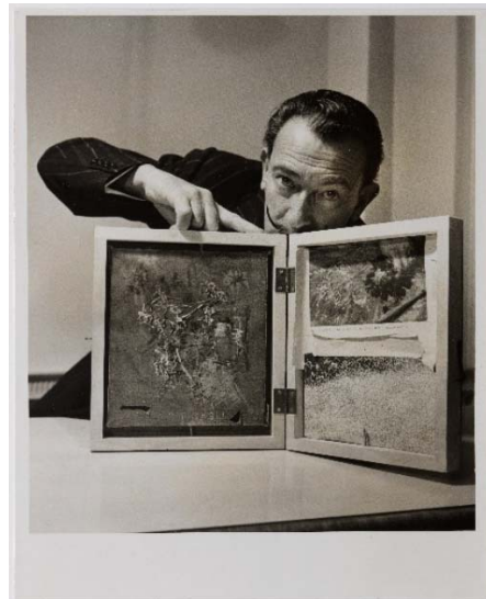
Salvador Dalí with the oil painting The Servant of the Disciples of Emmaus and studio material, ca. 1960. Image rights of Salvador Dalí reserved.