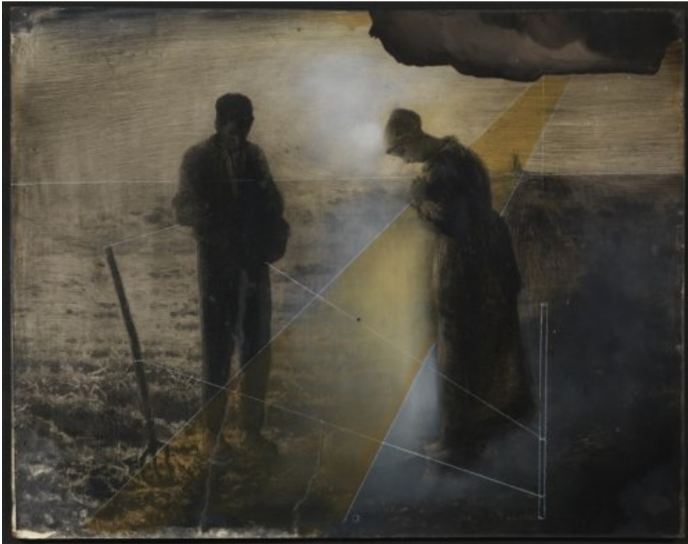
© Salvador Dalí, Fundació Gala-Salvador Dalí, Figueres, 2017