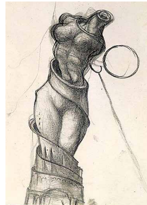
Salvador Dalí Preparatory drawing for Walt Disney's "Destino", c. 1946 Charcoal on paper 29,9 x 21,3 cm