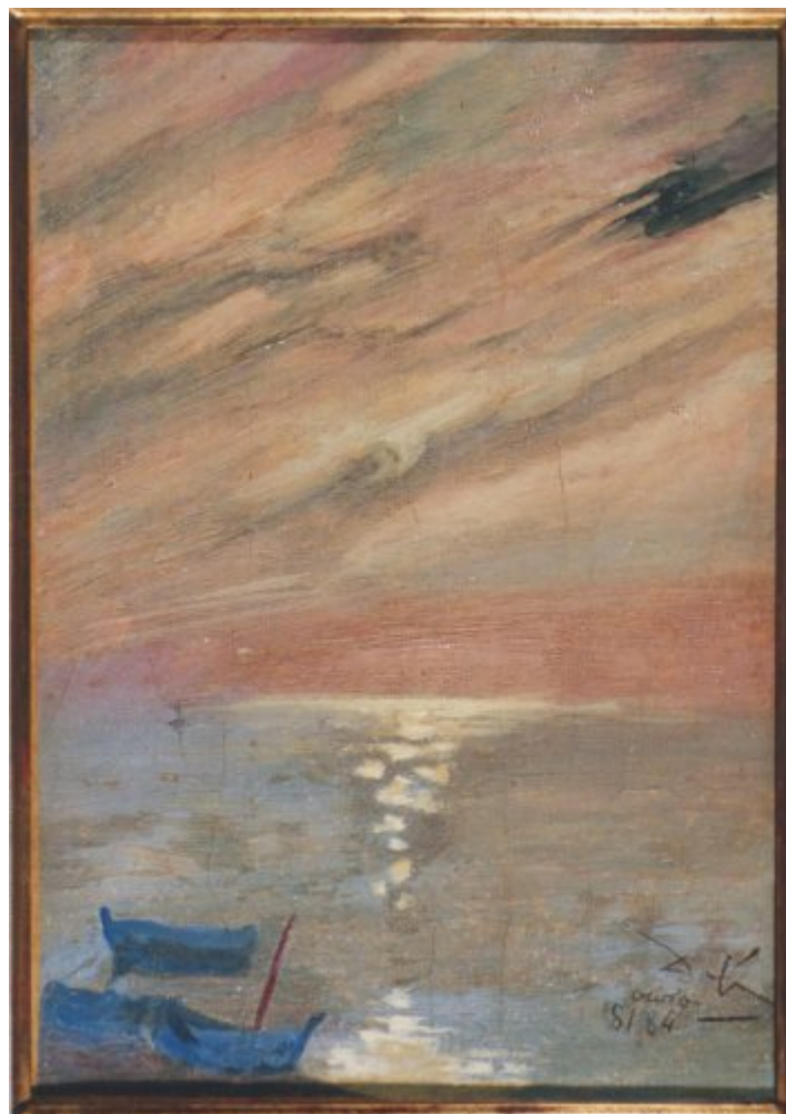
© Salvador Dalí, Fundació Gala-Salvador Dalí, Figueres, 2004