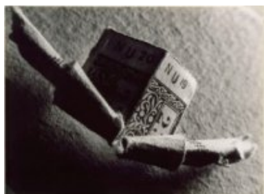
© Salvador Dalí, Fundació Gala-Salvador Dalí, VEGAP, Figueres, 2019