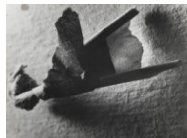
© Salvador Dalí, Fundació Gala-Salvador Dalí, VEGAP, Figueres, 2019