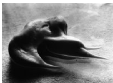
© Salvador Dalí, Fundació Gala-Salvador Dalí, VEGAP, Figueres, 2019