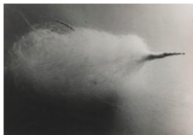
© Salvador Dalí, Fundació Gala-Salvador Dalí, VEGAP, Figueres, 2019