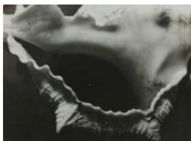
© Salvador Dalí, Fundació Gala-Salvador Dalí, VEGAP, Figueres, 2019 Brassai © Estate Brassai-RMN-Grand Palais