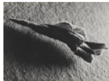
© Salvador Dalí, Fundació Gala-Salvador Dalí, VEGAP, Figueres, 2019