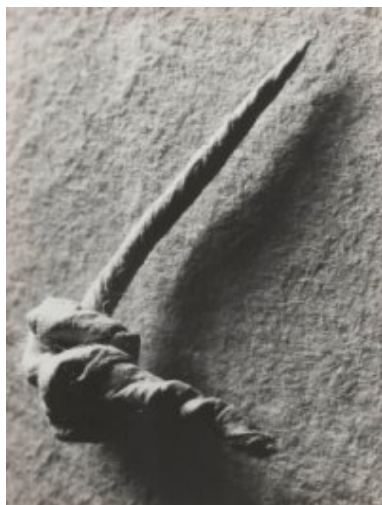
© Salvador Dalí, Fundació Gala-Salvador Dalí, VEGAP, Figueres, 2019 Brassai © Estate Brassai-RMN-Grand Palais