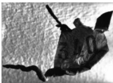
© Salvador Dalí, Fundació Gala-Salvador Dalí, VEGAP, Figueres, 2019 © Estate Brassai Succession - Philippe Ribeyrolles