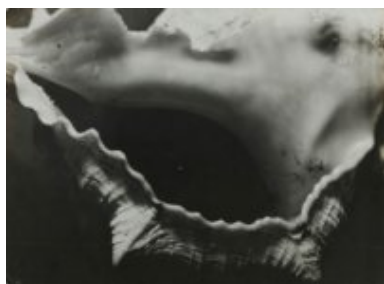
© Salvador Dalí, Fundació Gala-Salvador Dalí, VEGAP, Figueres, 2019 Brassai © Estate Brassai-RMN-Grand Palais