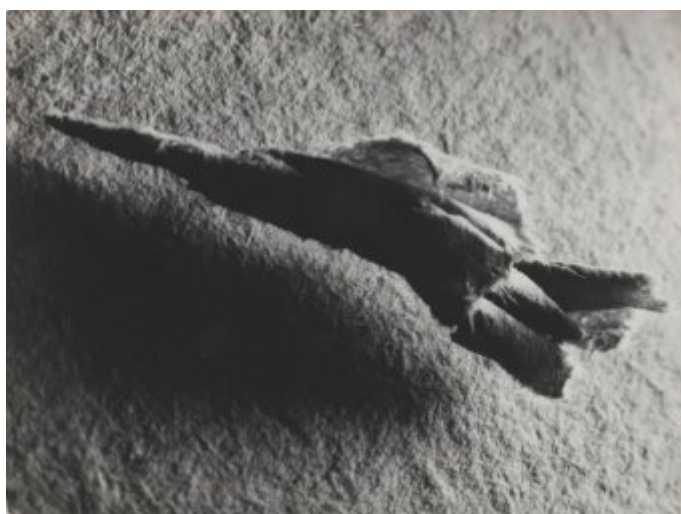
© Salvador Dalí, Fundació Gala-Salvador Dalí, VEGAP, Figueres, 2019