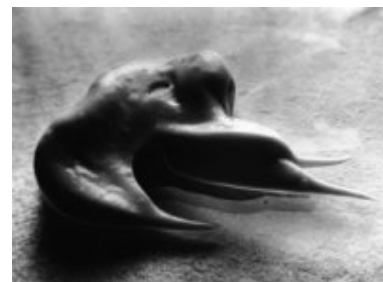
© Salvador Dalí, Fundació Gala-Salvador Dalí, VEGAP, Figueres, 2019 © Estate Brassai Succession - Philippe Ribeyrolles