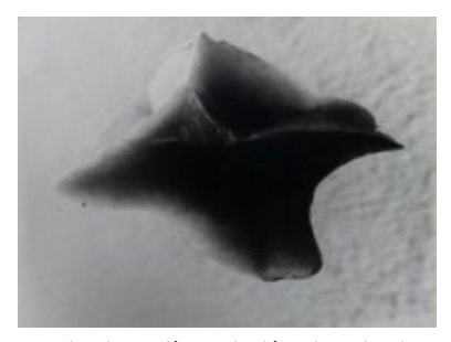
© Salvador Dalí, Fundació Gala-Salvador Dalí, VEGAP, Figueres, 2019 Brassaï © Estate Brassaï-RMN-Grand Palais