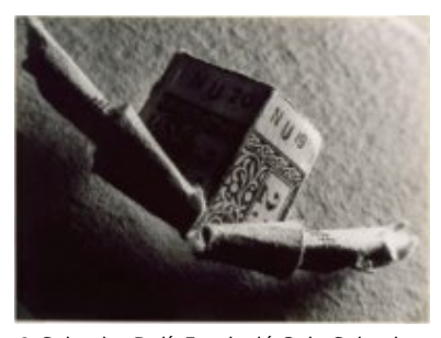
© Salvador Dalí, Fundació Gala-Salvador Dalí, VEGAP, Figueres, 2019