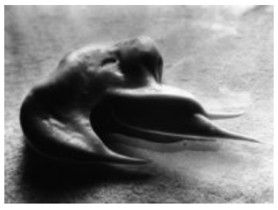
© Salvador Dalí, Fundació Gala-Salvador Dalí, VEGAP, Figueres, 2019