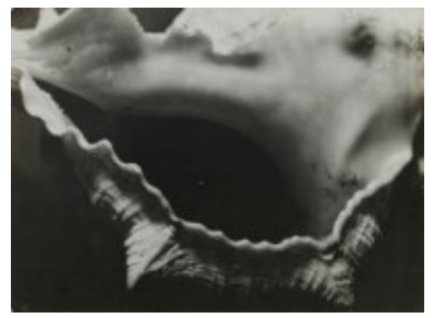
© Salvador Dalí, Fundació Gala-Salvador Dalí, VEGAP, Figueres, 2019

Cat. no. OE 12 Untitled. Automatic object ca. 1933