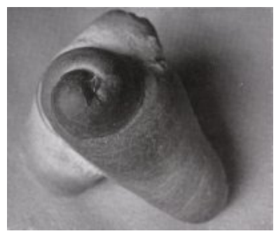
© Salvador Dalí, Fundació Gala-Salvador Dalí, VEGAP, Figueres, 2019 © Estate Brassaï Succession