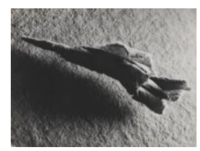
© Salvador Dalí, Fundació Gala-Salvador Dalí, VEGAP, Figueres, 2019 Brassaï © Estate Brassaï-RMN-Grand Palais

Piece of cotton wool instantly rolled up and abandoned (category of waborted automatisms»)