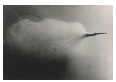
© Salvador Dalí, Fundació Gala-Salvador Dalí, VEGAP, Figueres, 2019