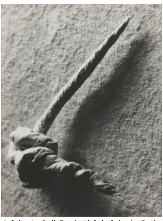
© Salvador Dalí, Fundació Gala-Salvador Dalí, VEGAP, Figueres, 2019 Brassaï © Estate Brassaï-RMN-Grand Palais

Author: Salvador Dalí i Domènech - Gyula Halász, alias