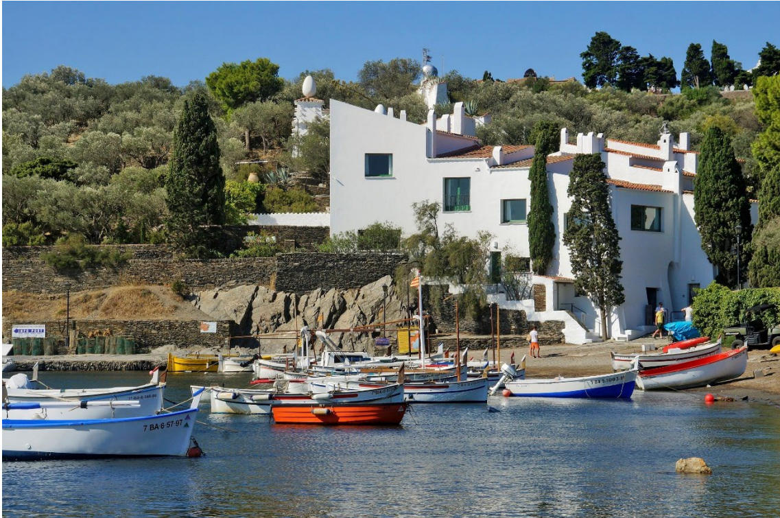
Salvador Dalí House-Museum, Portlligat Bay