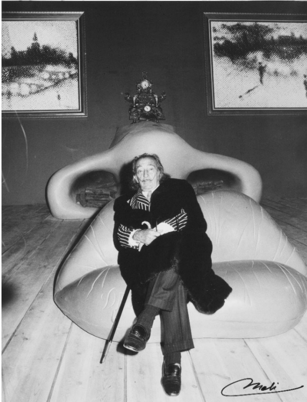
Dalí in Mae West Room.