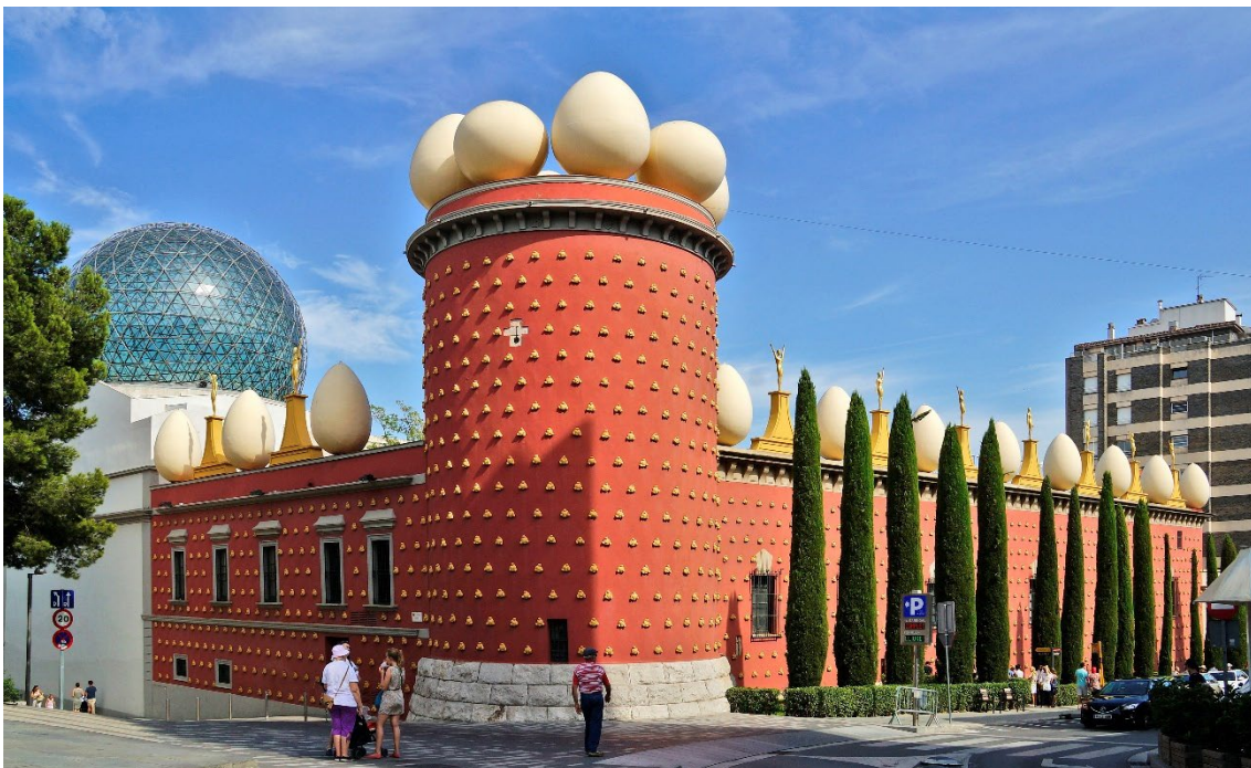
Galatea Tower. Headquarters of the Dalí Foundation. Figueres