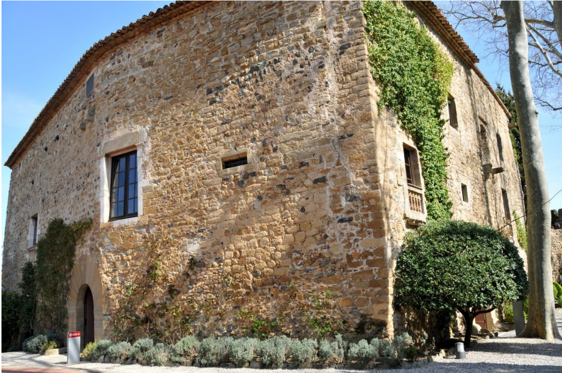
Gala Dalí Castle, Púbol