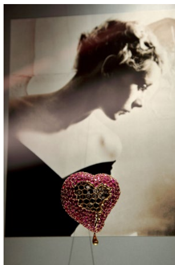
The Dalí·Jewels gallery

“Without a public, without the presence of spectators, these jewels would not fulfil the function for which they were created. The spectators thus become the final artists. Their vision, their heart, their mind — fused with and capturing with greater or lesser understanding the creator's intention — lend them life.”