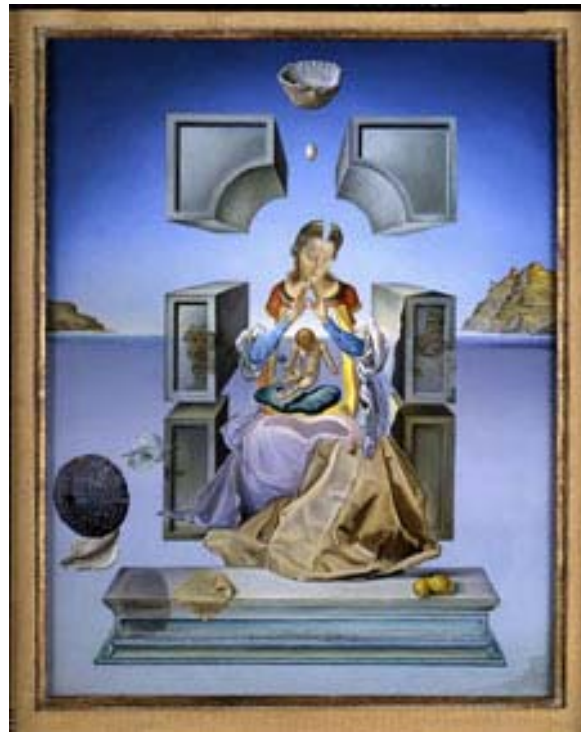
The Madonna of Portlligat (first version), 1949.