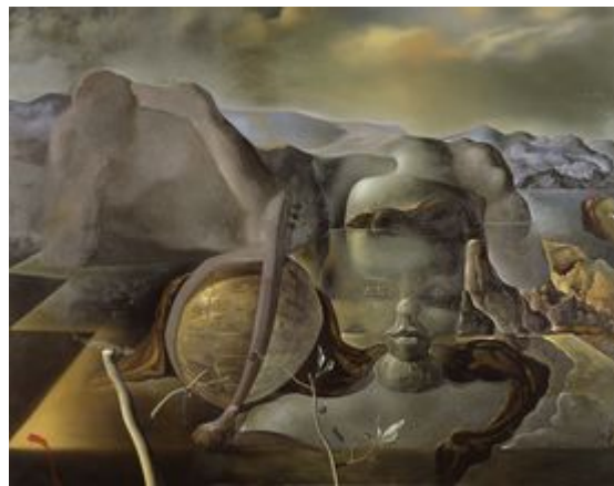
Endless Enigma , ca 1938.