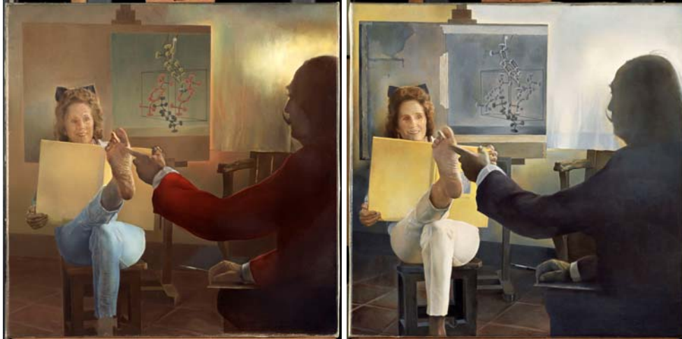
Gala's Foot . Stereoscopic work in two elements, ca 1975-76.

at one and the same time the external and internal reality of the viewer through different methods: double images, stereoscopy, holography or by seeking out the fourth dimension, following the advances of science. It may be that such representations did not coincide with the viewers' actual vision, but they did induce in them a number of mental associations that could end up submerging them in the discourse of the painter.