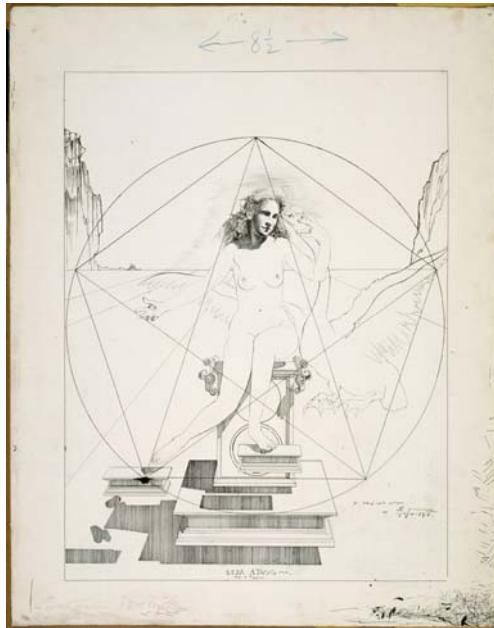
Preparatory drawing for Leda Atomica , 1947.

come works such as Uranium and Atomica Melancholica Idyll , 1945 18 ; Intra-Atomic Equilibrium of a Swan's Feather , 1947 19 ; Dematerialization Near the Nose of Nero , 1947 20 , and The Three Sphinxes of Bikini , 1947 21 .